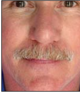
AFTER, 2 treatments