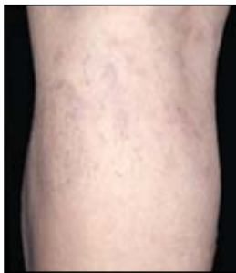
AFTER, 1 treatment